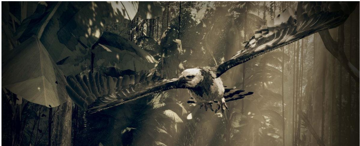
2019 © Interactive Media Foundation gGmbH / Inside Tumucumaque: Capture Harpyie

We're bringing the Brazilian rainforest to Berlin: our virtual reality experience Inside Tumucumaque will be shown at Hamburger Bahnhof – Museum for Contemporary Art – Berlin from 07-11 May 2019 .